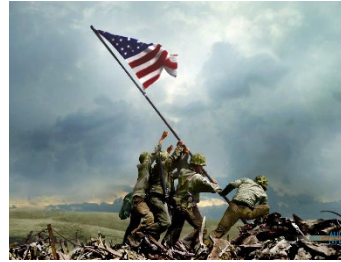
US Marines raise second flag on Mt. Suribachi, Iwo Jima, Feb. 23, 1945

Feb 1st- SAL Monthly Mtg, 7pm Feb 8th - General Meeting 7pm Feb 2 nd , 9 th , 16 th , 23 rd Karaoke 7:30 pm Feb 11 th - Valentine's Dance 8pm Feb 22 nd , E.C. Meeting, 7:00 pm Bingo - Every Sunday 6:00 pm Euchre - Every Thursday 7:00 pm Every Friday 12:00 pm Fish Fry- Every Friday, Feb. 24 th - April 7 th 5:00 pm