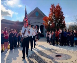
Immaculate Heart of Mary School