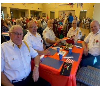
Anderson Senior Ctr.